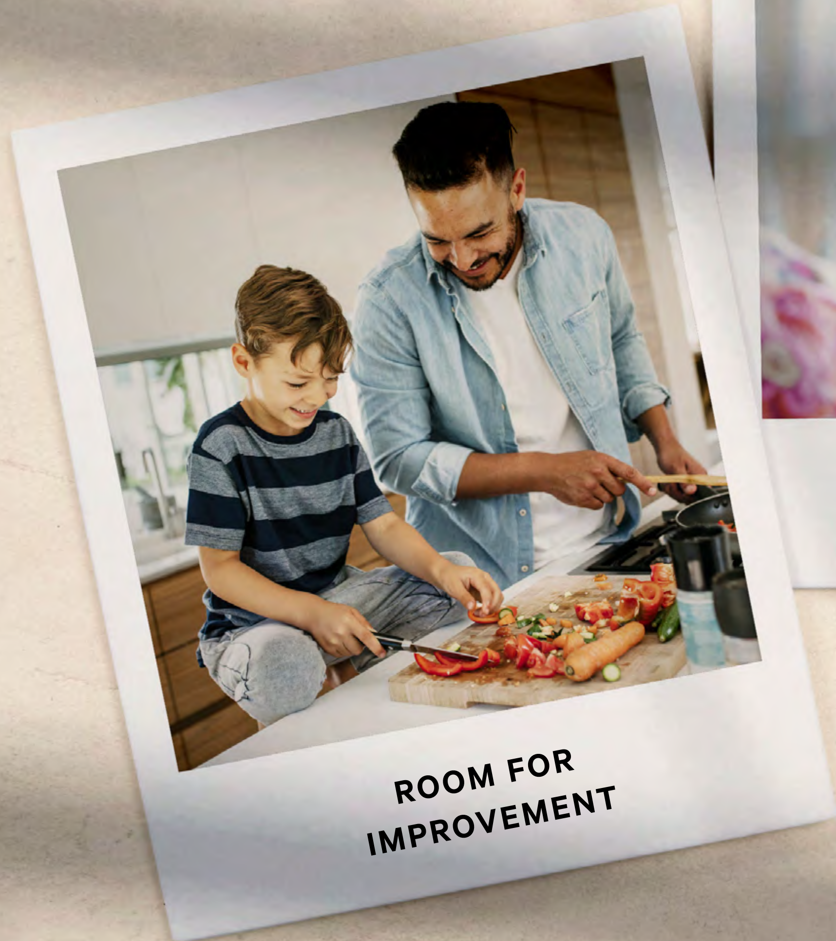
ROOM FOR IMPROVEMENT