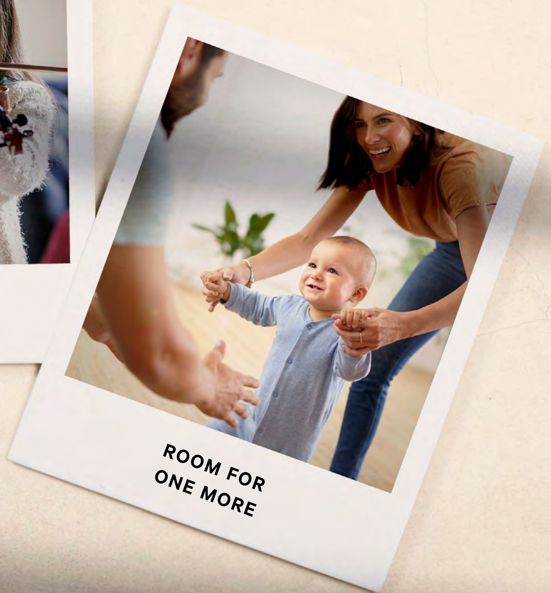
ROOM FOR ONE MORE