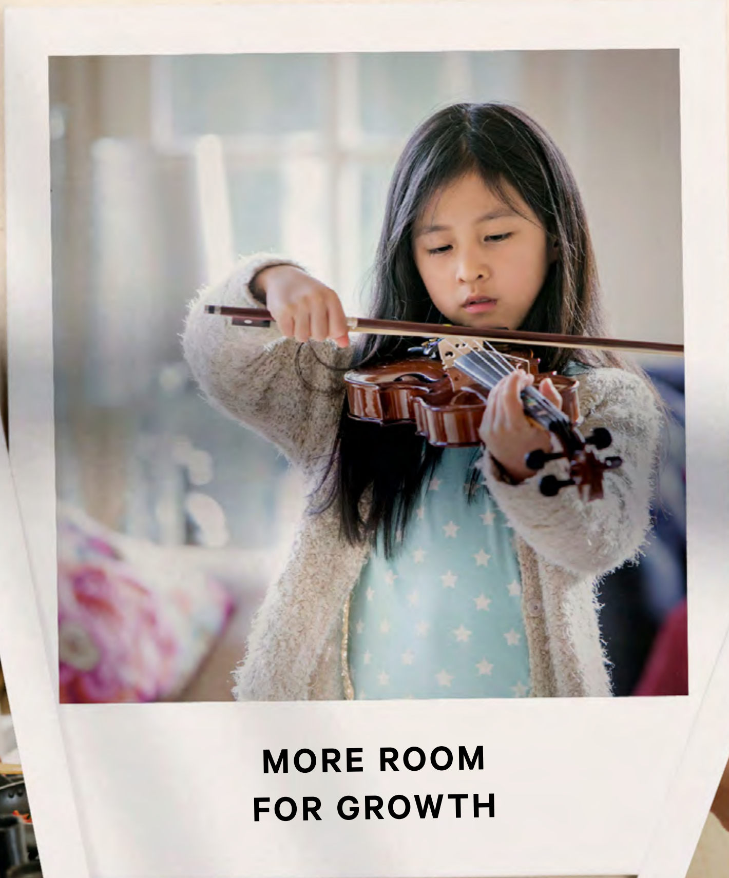
MORE ROOM FOR GROWTH